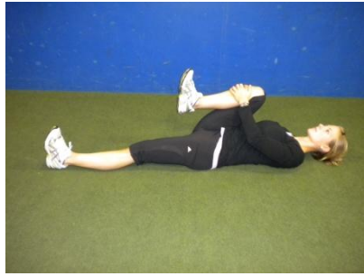
Lying Alternating Knee Pull March