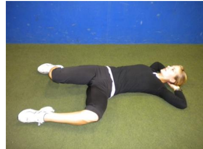
Prisoner Arms Feet Wide Si2Si Knee Drop