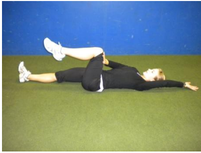
ACTivated Opposite Arm & Leg Dead Bug