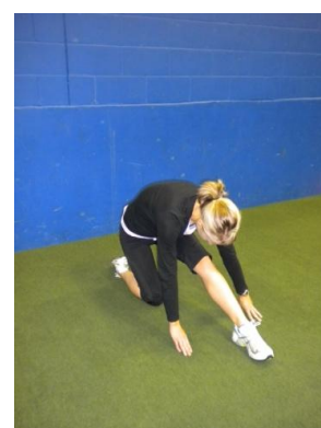
Split Kneel Hip Flexor 3 Way