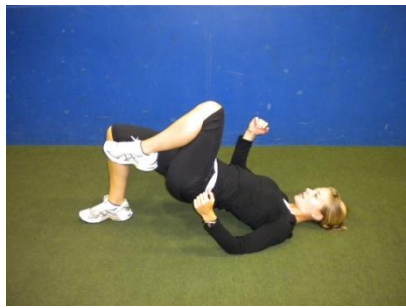
1 Foot Bridge + Opposite Foot Knee Tuck Hold